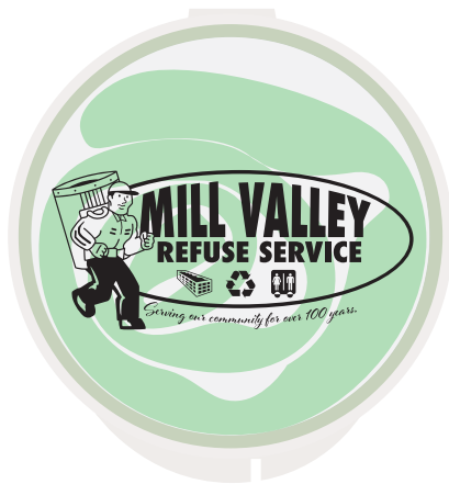
Option 1- Original art

Imprint Method: Pad Print on the Top: Black