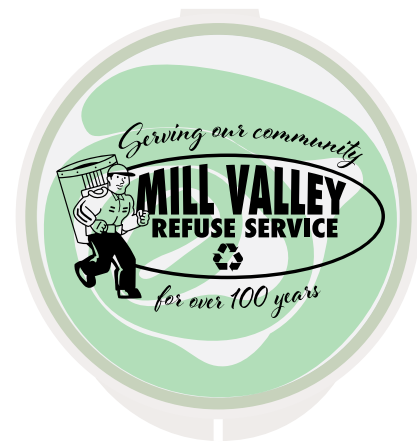
Option 2- Suggested change