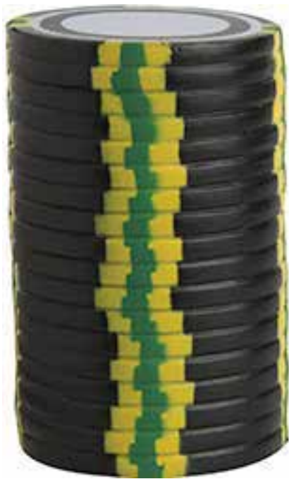
3.25" x 2"