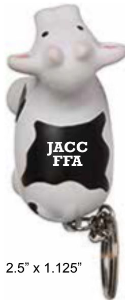
2.5" x 1.125"