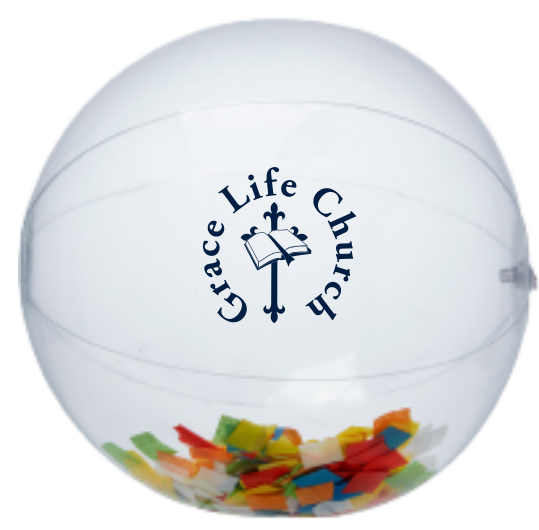
Graphic is for placement only not to scale