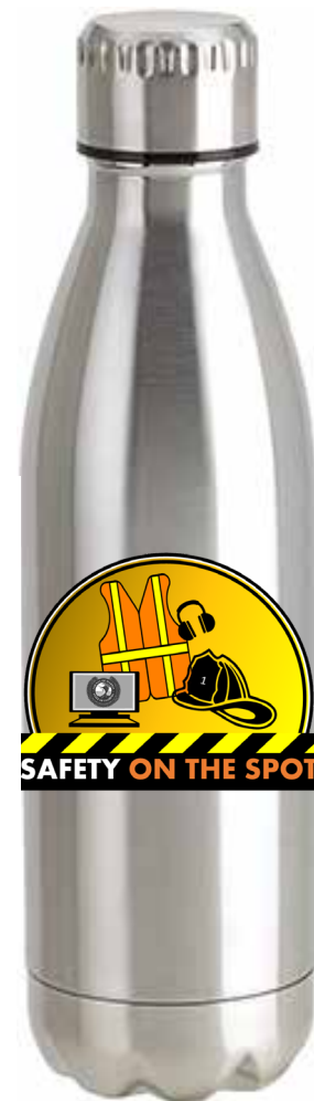
Note: Art will wrap around the sides of the bottle slightly