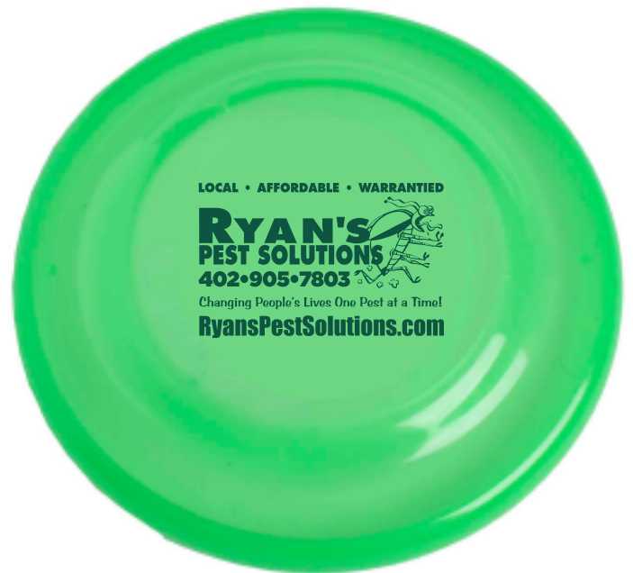
Graphic is for placement only Not to scale