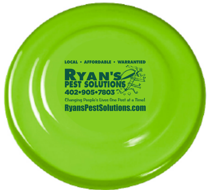
Graphic is for placement only Not to scale