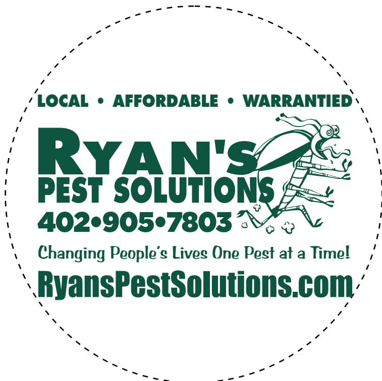
Actual Size of Imprint Dotted Lines Do Not Print

Note: i adjusted the text in the logo slightly so that it could all print legibly