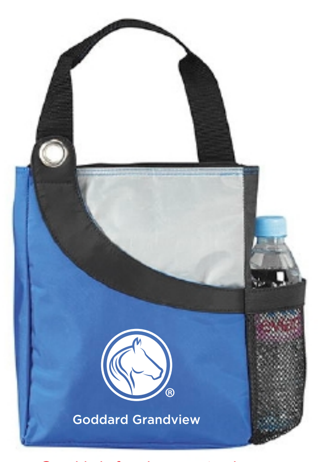
Graphic is for placement only Not to scale

Actual Size of Imprint Dotted Lines Do Not Print