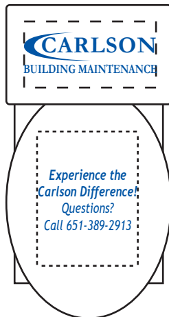
Actual Size of Imprint Dotted Lines Do Not Print

IMPORTANT NOTE: The proof below shows the artwork exactly how it was printed on your previous order. On your last order, you printed on both the tank and the lid. On this new order, only the lid was selected. If you approve the proof as shown below, you will need to approve additional charges for the second imprint location.