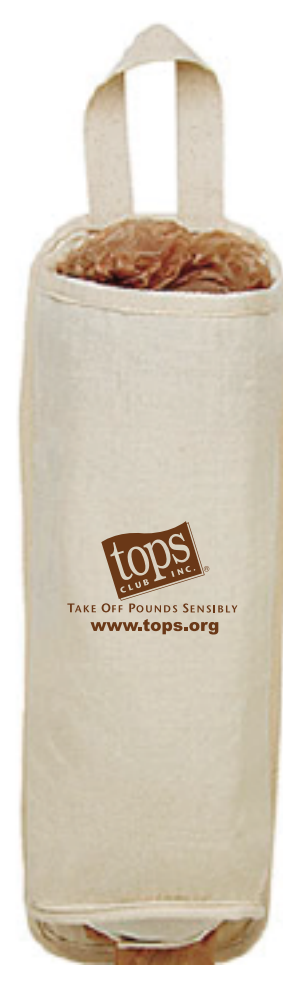
Graphic is for placement only Not to scale