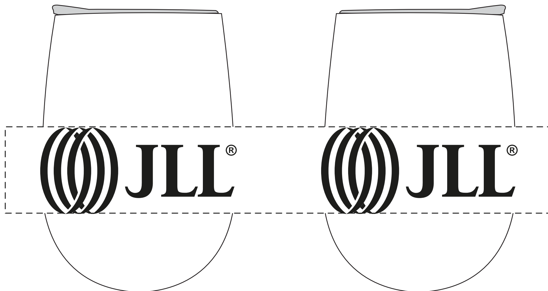
WRAP AROUND IMPRINT