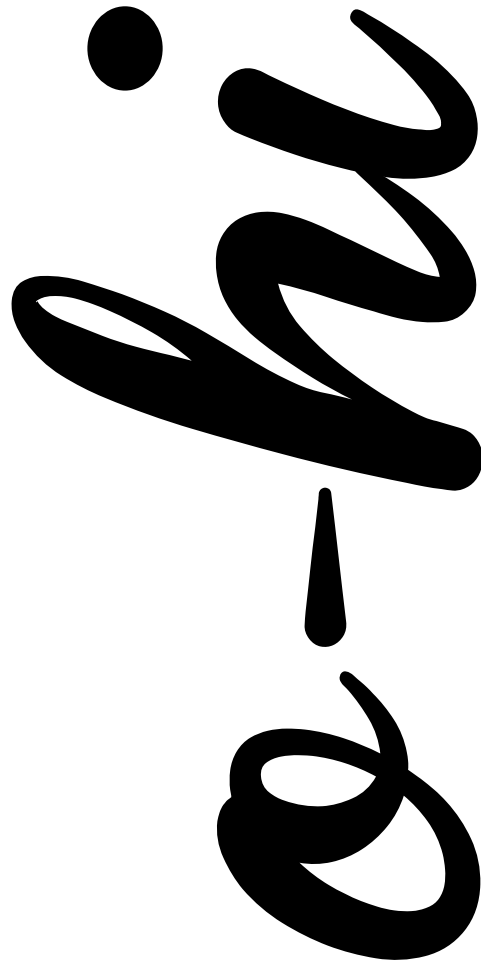
Actual Size of Imprint