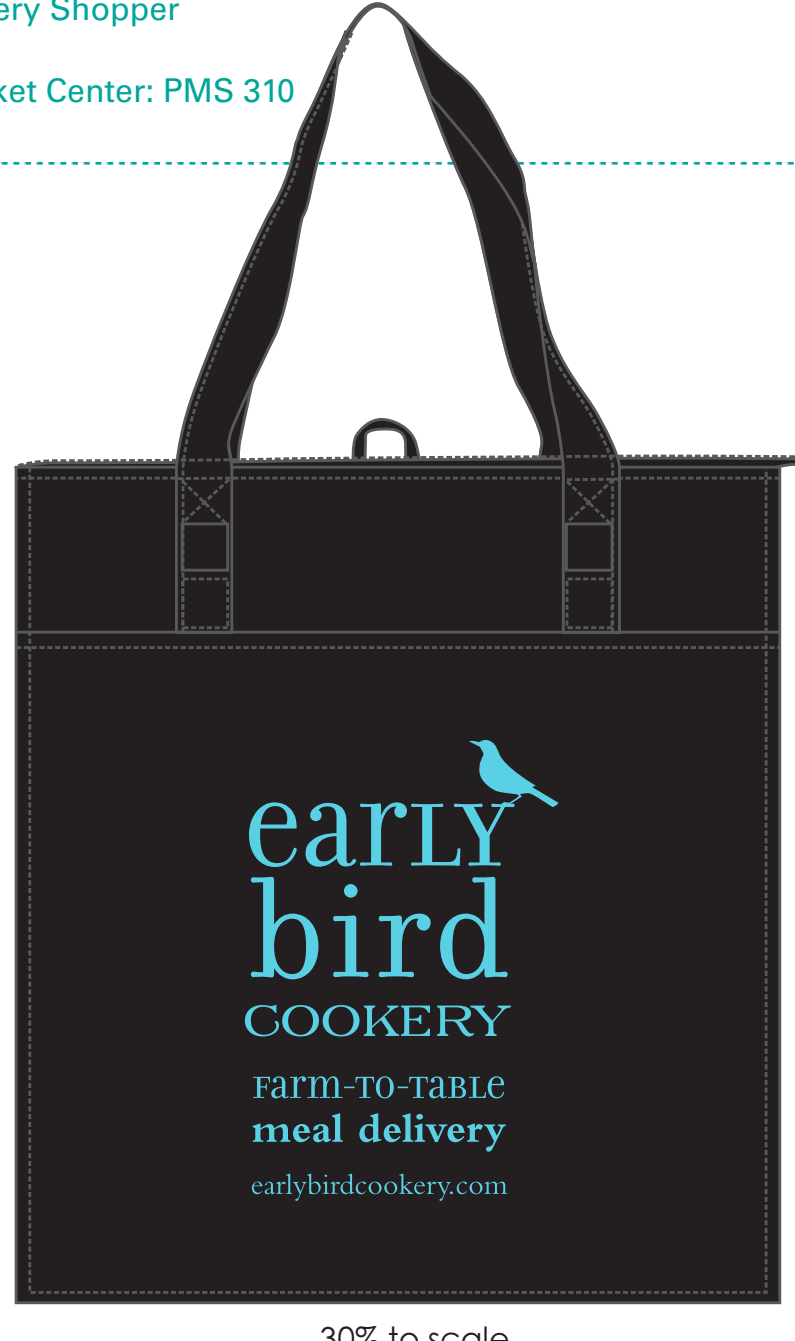
30% to scale