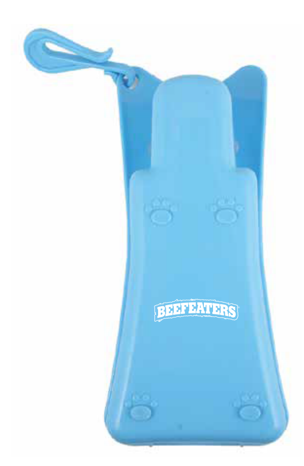
50% to size