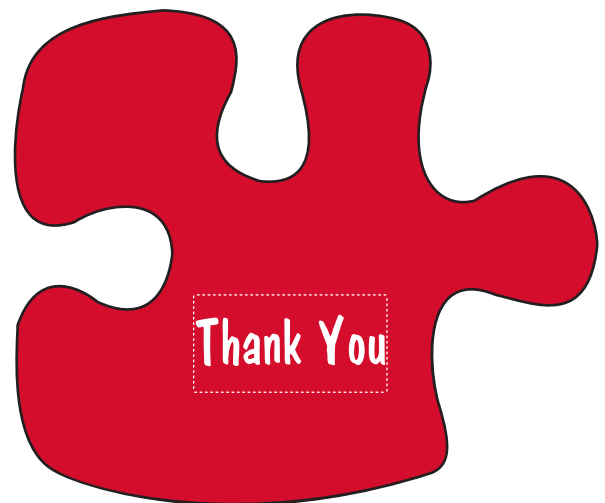
Actual Size of Imprint Dotted Lines Do Not Print