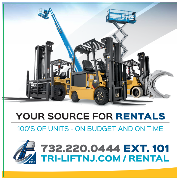
Cube Side (Shown with Full Bleed)

Order#: 141638-Q Product: dhesive Cubes Item #: 1090-304593 Imprint Method: 4 Color Process on the 1-4 Sides Actual Imprint Size: 3"W x 3"H on each side