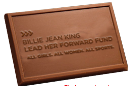
The image above is an approximate rendering of the chocolate.