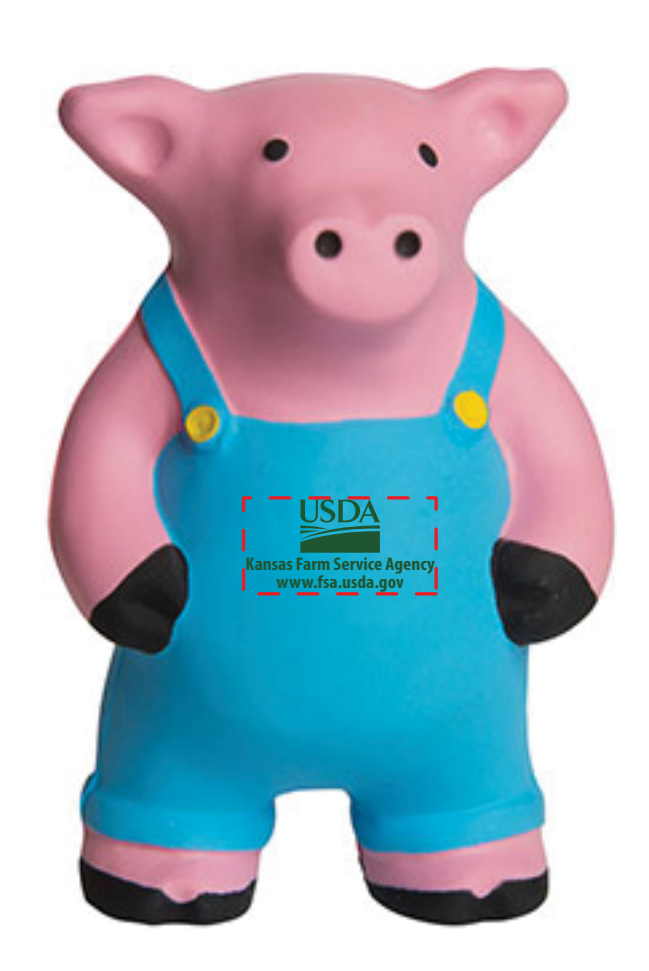
NOTE: The kelly Green imprint color will not contrast well on this item. I recommend the darker Forest Green 357.