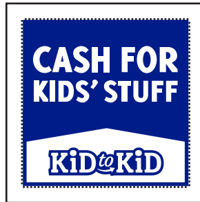
Actual Size of Imprint