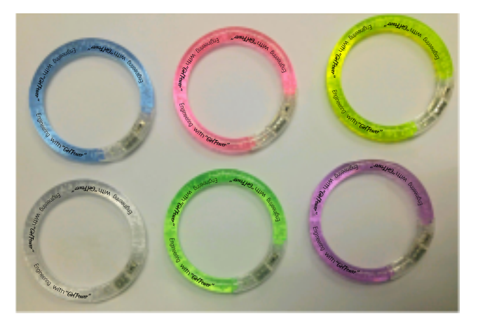
Graphic is for placement only not to scale