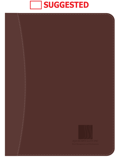
Items above shown at 25% of Actual Size