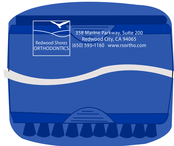
Clean Sweep Monitor Brush Front