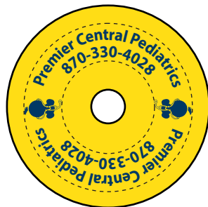
Actual Size of Imprint Dotted Lines Do Not Print

NOTE: The small details in the baby logo might fill in when printed, due to the small size