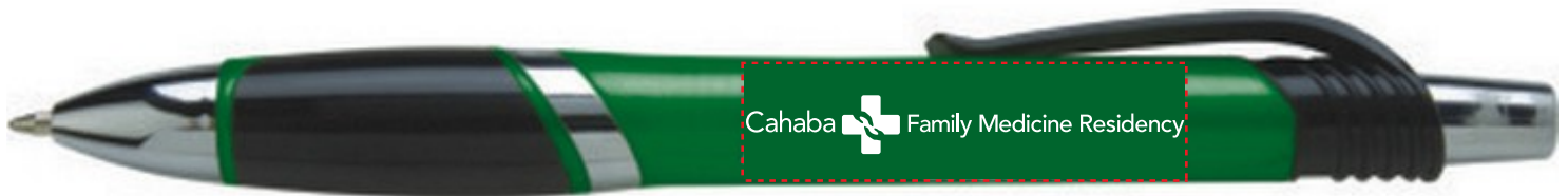
Image Not To Size For Reference Only