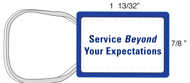
Dotted line represents imprint area