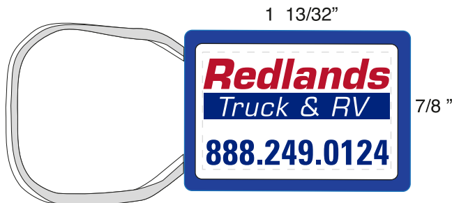
Dotted line represents imprint area