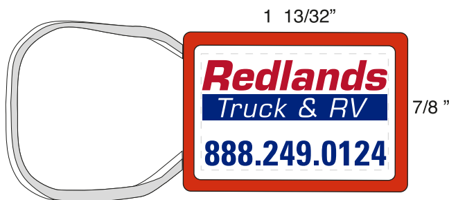
Dotted line represents imprint area