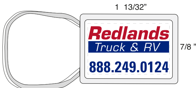
Dotted line represents imprint area