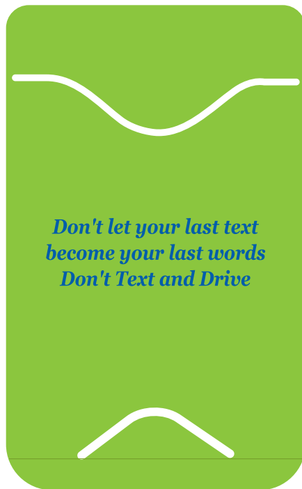
Mobile Wallet (Top)