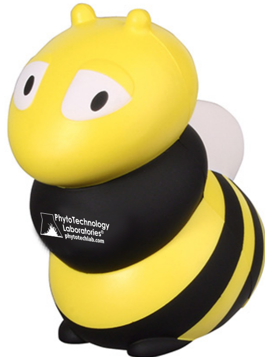
For Reference Only

Actual Size of Imprint Dotted Lines Do Not Print