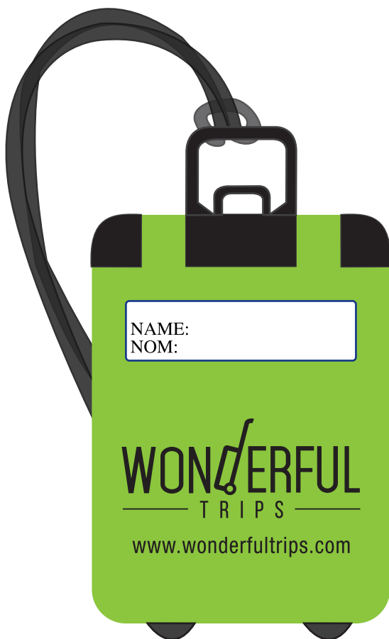
Travel Tote Luggage Tag Green