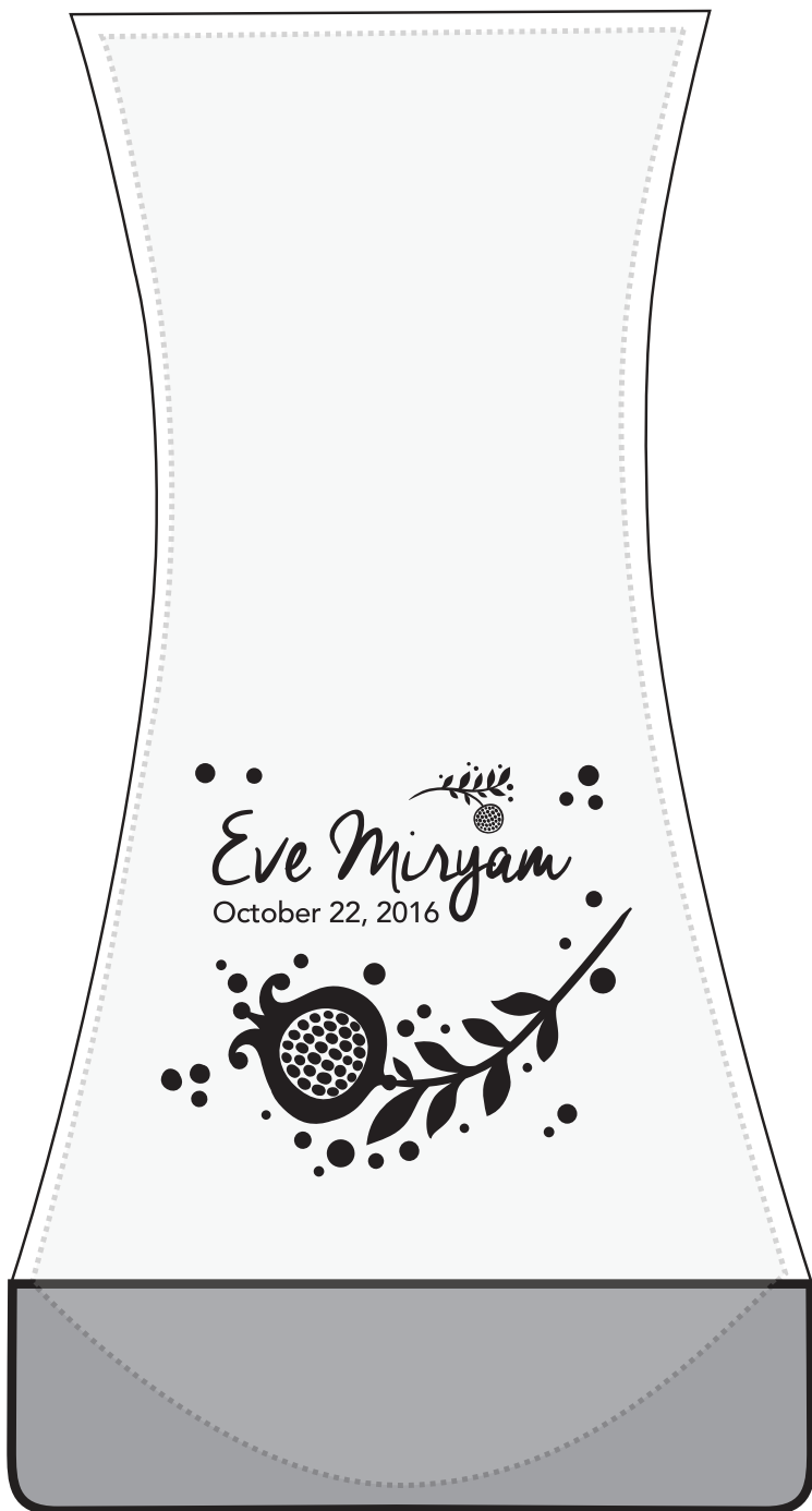
Item shown @ 75% Enlarge @ 133.3% to see actual size

Please be advised that some intricate details and fine lines in the logo artwork may fill in randomly. We will require your permission to print as is.