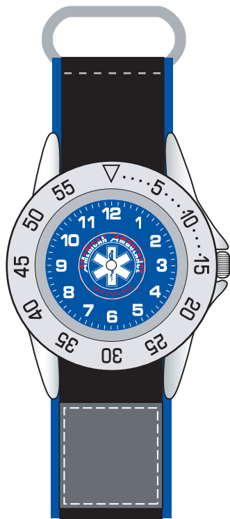
100 % OF ACTUAL SIZE

NOTE: Our manufacturer confirmed that the small text and details in the art will fill in. Please advise if this is okay or if you'd like to submit new artwork that will fit better in the small imprint area.