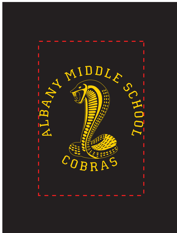
Actual Size of Imprint Dotted Lines Do Not Print

Please note: Some of the small details in the cobra logo may fill in and bleed when printed