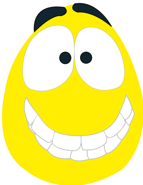
Mood Manic Wobbler - Happy Back