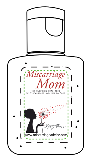
Option 1- Original Layout

Our manufacturer has stated that all of the text except for "Miscarriage Mom" is too small and will fill in when printed