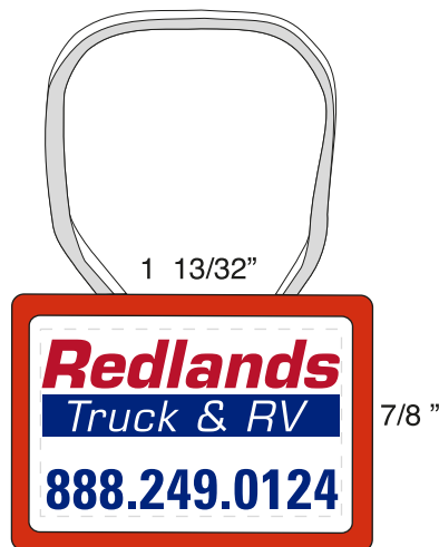
Dotted line represents imprint area

Order#: 129307 Product: Letter Perfect Showing - Red and Black Item #: 1215-301363 Imprint Method: Screen Print on the Front & Back (Paper Insert) Front - Dark Blue 280 Red 200 Back - Dark Blue 280