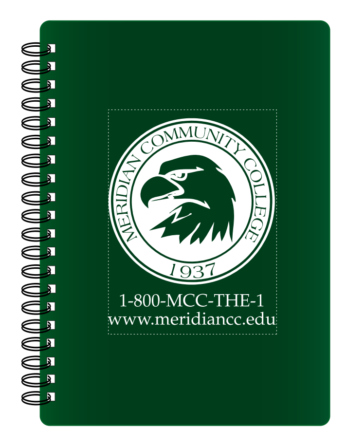
60% OF ACTUAL SIZE

Imprint Method: Screen on the Front - White