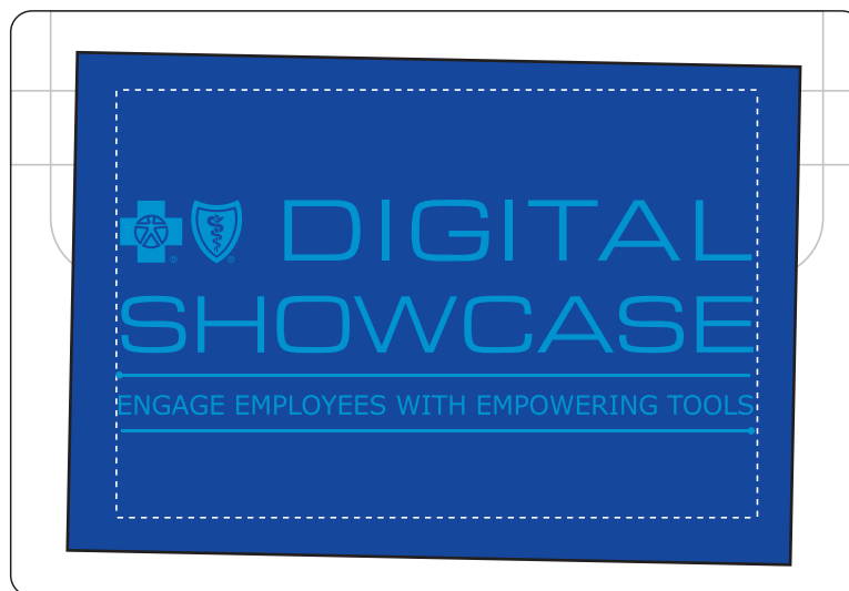
Actual Size of Imprint Dotted Lines Do Not Print

Note: Some small details in the logo might fill in when printed