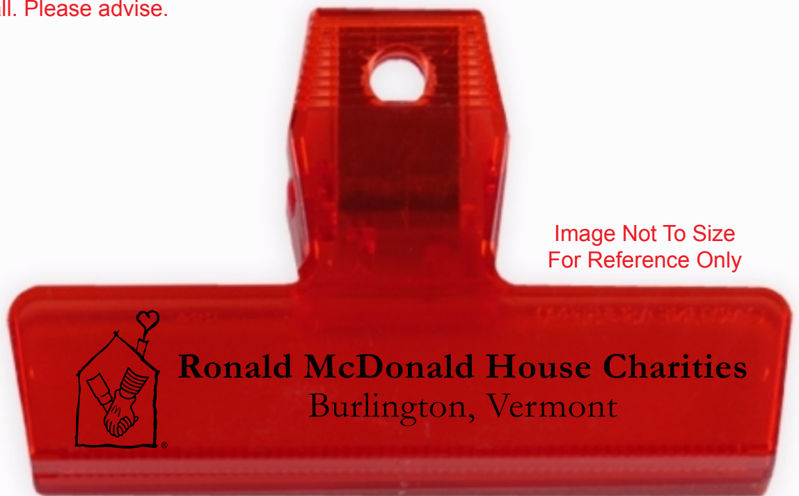
Image Not To Size For Reference Only

Note: Some of the small details in your logo might fill in when printed because they are so small. Please advise.