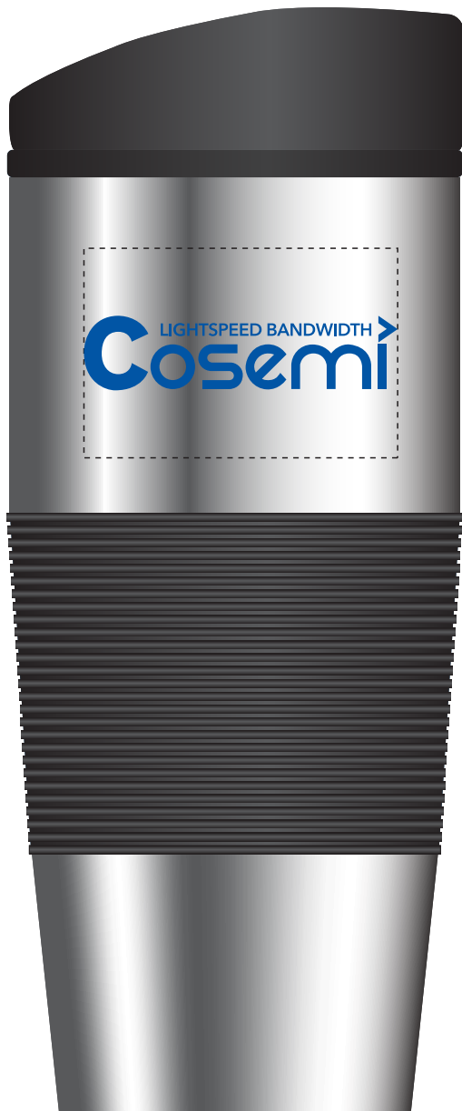
80 % OF ACTUAL SIZE

Imprint Method: Silkscreen on the Front - Reflex Blue