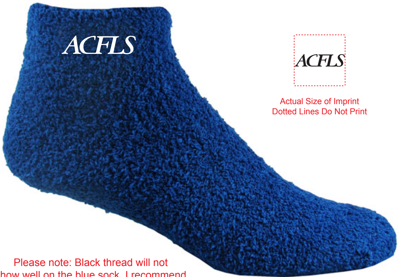
Actual Size of Imprint Dotted Lines Do Not Print

Imprint Method: Embroidery on the Side of Sock