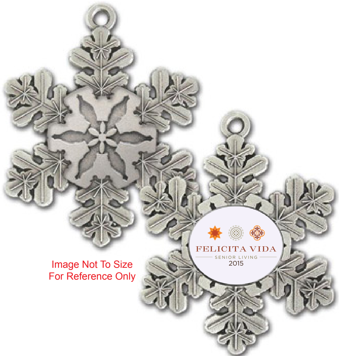
Image Not To Size For Reference Only

Actual Size of Imprint Dotted Lines Do Not Print