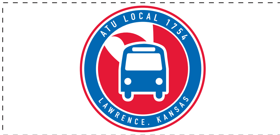
Actual Size of Imprint