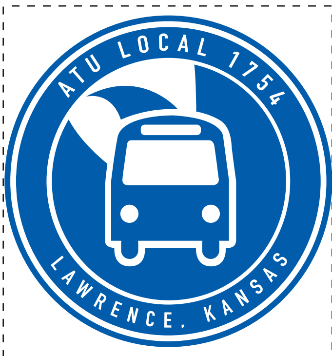
Actual Size of Imprint