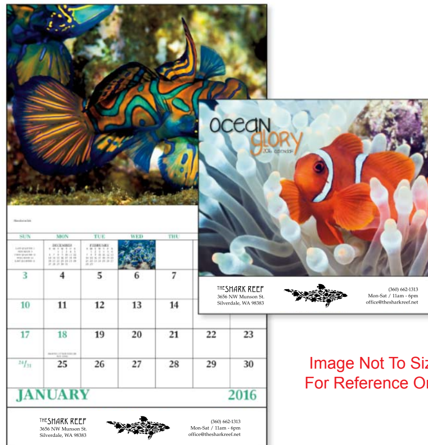
Image Not To Size For Reference Only

(360) 662-1313 Mon-Sat / 11am - 6pm office@thesharkreef.net