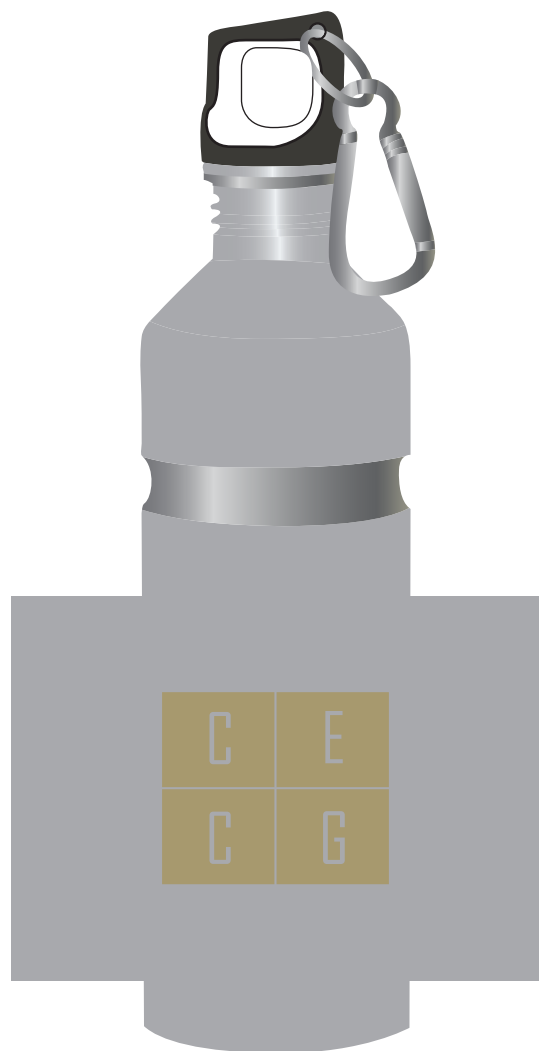
Item shown @ 50% Enlarge @ 200% to see actual size

Imprint Method: Silkscreen on the Front - Metallic Gold 873