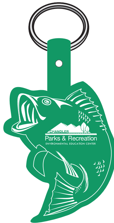
Actual Size of Imprint Dotted Lines Do Not Print

PLEASE NOTE: The imprint area is very small. A lot of the fine details in your logo may fill in when printed. Please review and advise me on how you would like to proceed regarding the art for this item.