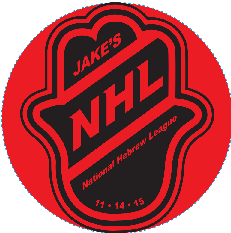
Actual Size of Imprint on Pouch & Scarf Dotted Lines Do Not Print

Imprint Method: Embroidery on the Pouch, Scarf, and Cap - Black