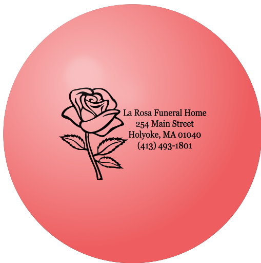
Actual Size of Imprint

Imprint Method: Pad Print on the First Side - Black