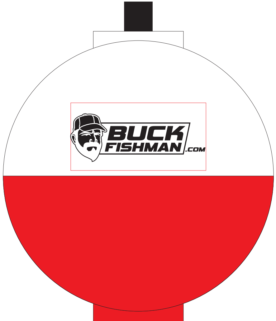
Enlarged for Clarity