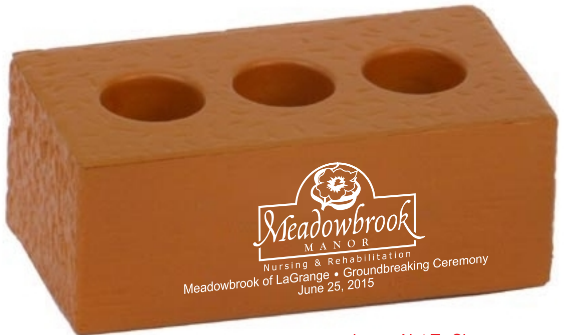
Image Not To Size For Reference Only

Actual Size of Imprint Dotted Lines Do Not Print