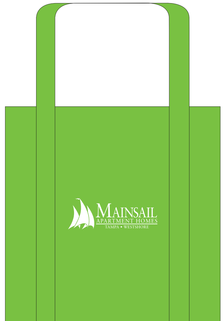
30% of actual size