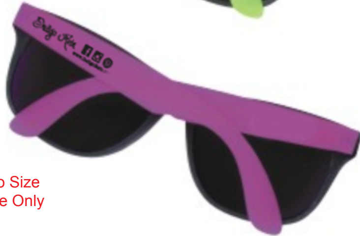
Image Not To Size For Reference Only